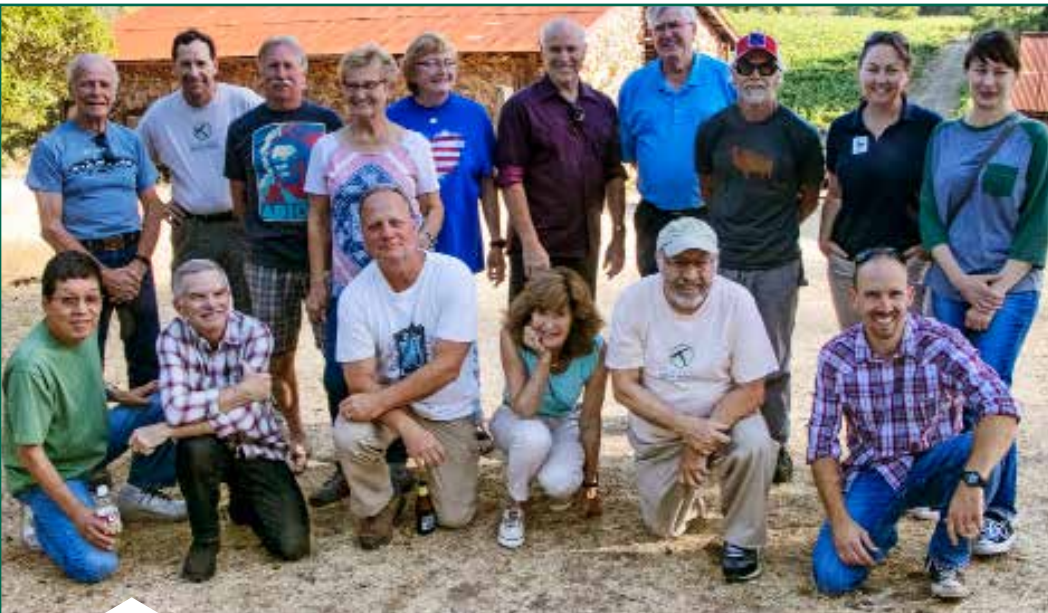
They made the ADA path a reality!