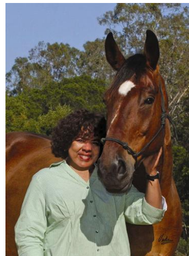
AKA: Highland Poacher